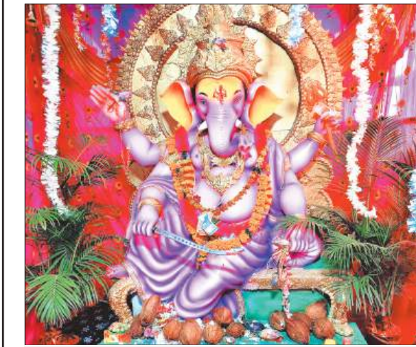
बजरंग गणेशोत्सव समिति, बजरंग चौक गोहरापदर