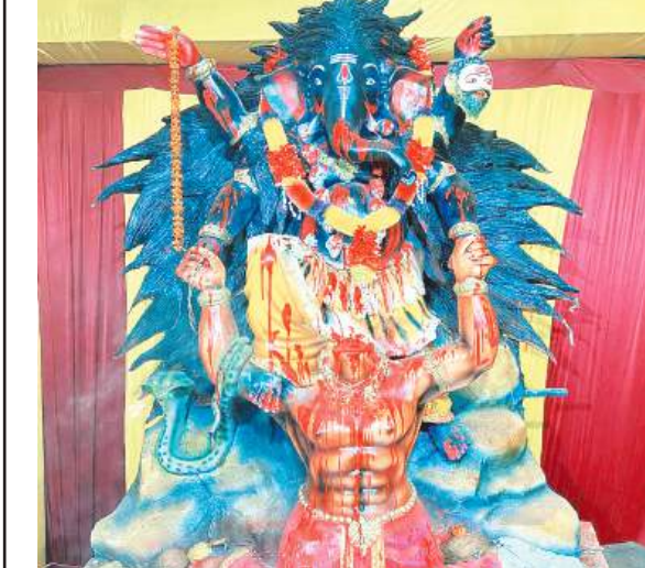
जयहिंद गणेशोत्सव समिति, आजाद चौक गोहरापदर

लगा दिया गया है, जिसका प्रचार-प्रसार स्वयं पेट्रोल पंप के कर्मचारी भी कर रहे हैं।